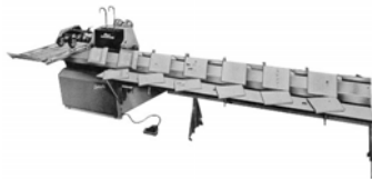
Shown with 213 Saddle Extension