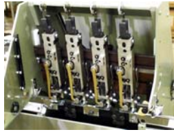
Up to 4 stitching heads can be used at one time. Easily adjustable and removable.