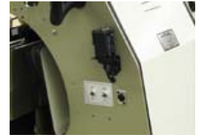
Sensor detects missing signatures over saddle and prevents stitching heads to stitch without a book present.