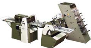
Stitcher within 318 Lynx System