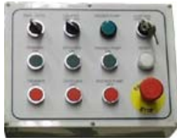
Conveniently located and large visible controls.