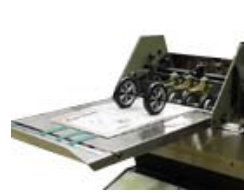
Positive delivery with single lever thickness adjustment of rollers assures positive book control throughout delivery.