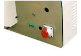
Easy connection for additional feeder and trimmer for your increasing customer demands.