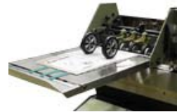
Positive delivery with single lever thickness adjustment of rollers assures positive book control throughout delivery.