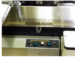
Conveniently located and large visible controls.