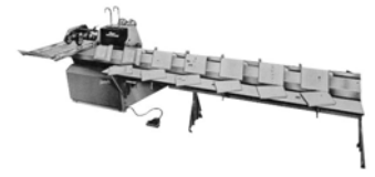
Optional 213 Saddle Extension