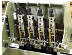
Up to 4 stitching heads can be used at one time. Easily adjustable and removable.