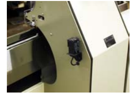
Sensor on 201B Models detect missing signatures over saddle and prevents the stitching heads to stitch without a book present.